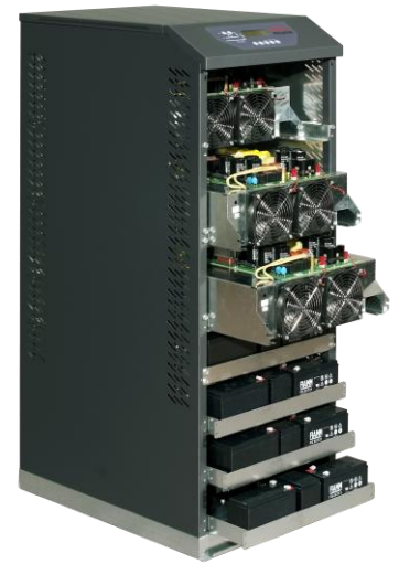
UPS electronics (modular construction / power modules)