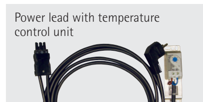
Power lead with temperature control unit